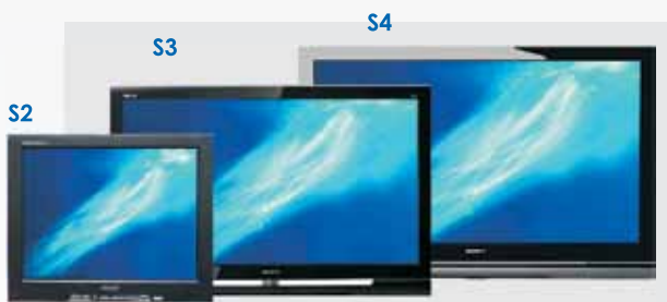
19" - HD Ready 485mm x 405mm 32" - HD Ready 790mm x 504mm 40" - HD Ready 990mm x 640mm