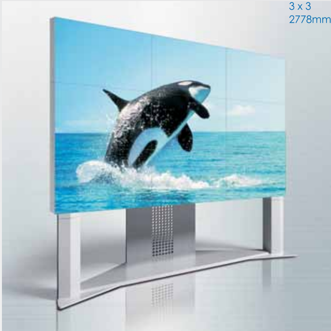
3 x 3 2778mm x 1569mm

Screencom is South Africa's leading supplier of Plasma Screens, LCD Monitors and peripheral equipment for daily hire at exhibitions, product launches, road shows, events and presentations.